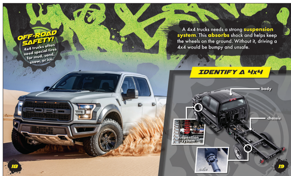
Sample spread from 4x4 Trucks